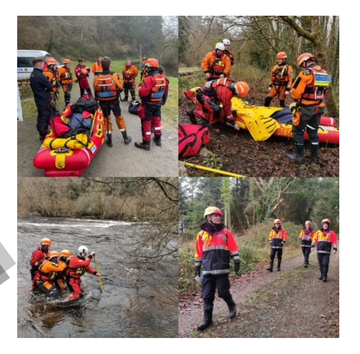
Team up to clean up. Rescuing a dog while on training course