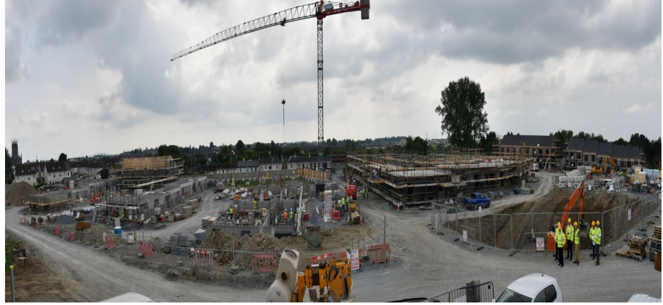
Construction Continues at Pace in Crokers Hill (photos above)