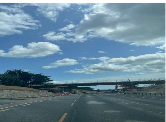
Construction remains marginally ahead of schedule. Substantial completion is expected by the end of 2023.