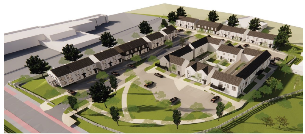
Above: 3D Impression of the 42 Units at Newtown, Ladywell, Thomastown which is in front of the new Primary Care Center in Thomastown (To be known as Abbey Hill Estate when complete)

All drawings and documents associated with these developments can be viewed on: <a href="https://consult.kilkenny.ie/">https://consult.kilkenny.ie/</a>