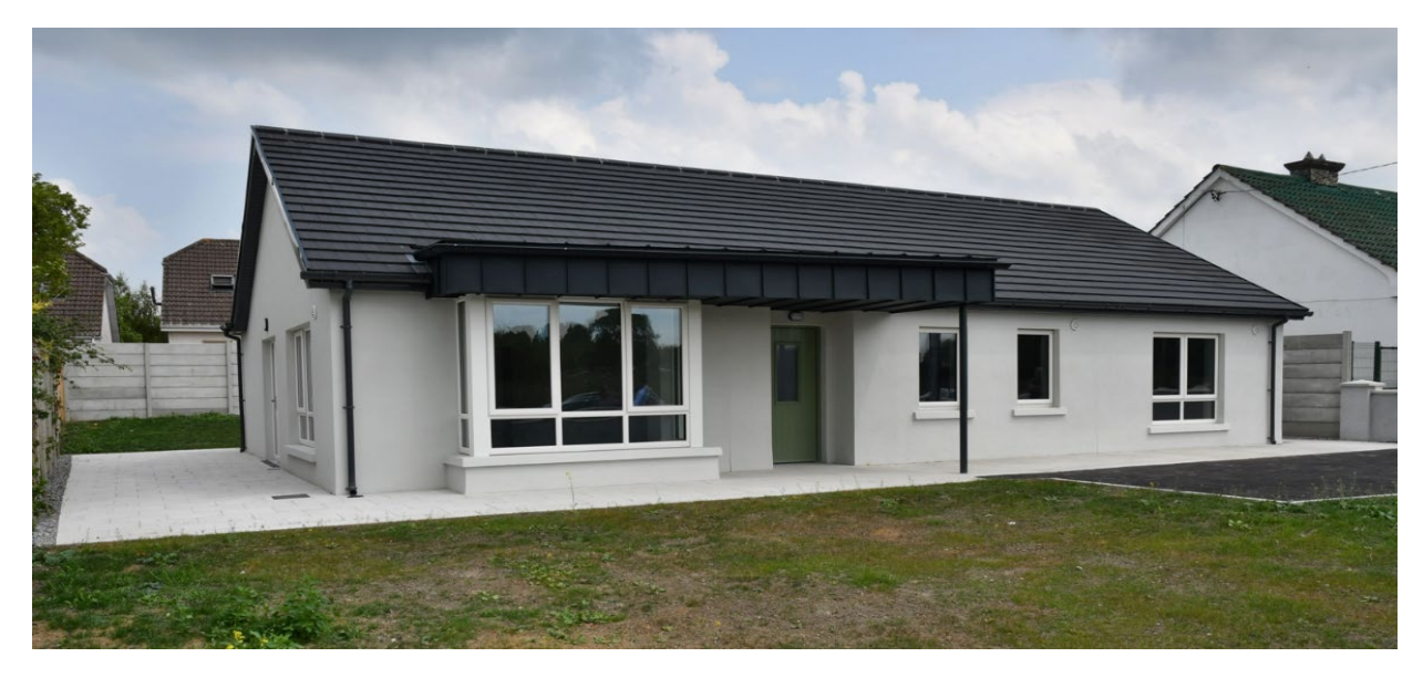
The above pictures are from Legan Grange, Thomastown, due to complete in July.