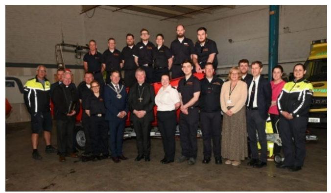
Launch of the new boat "Lady K"