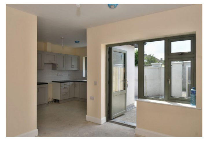
The above photos are of the 6 units, including 2 wheelchair accessible units, at Golf Links Road, Kilkenny due to be complete in July